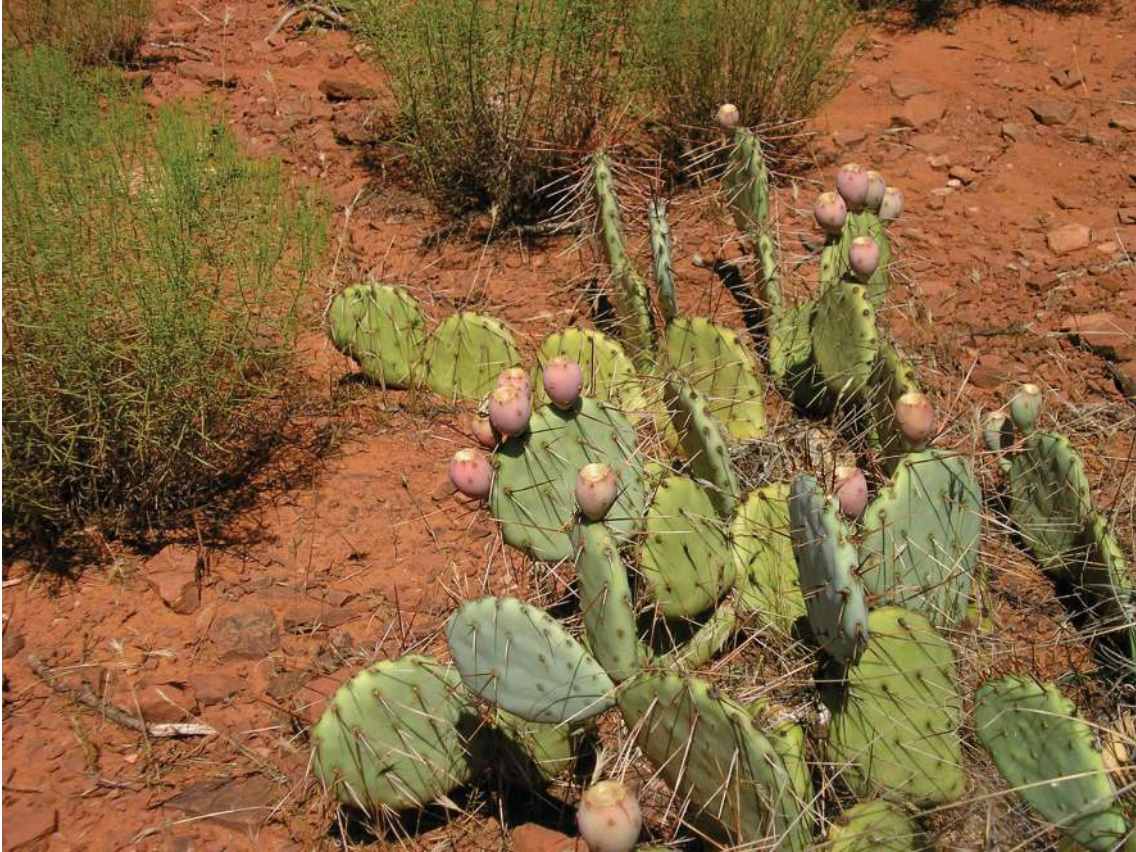
Photograph C for Question 6