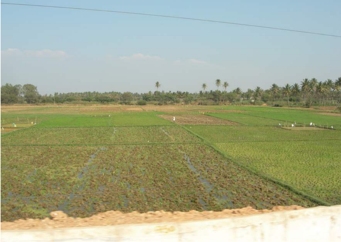
Photograph E for Question 6